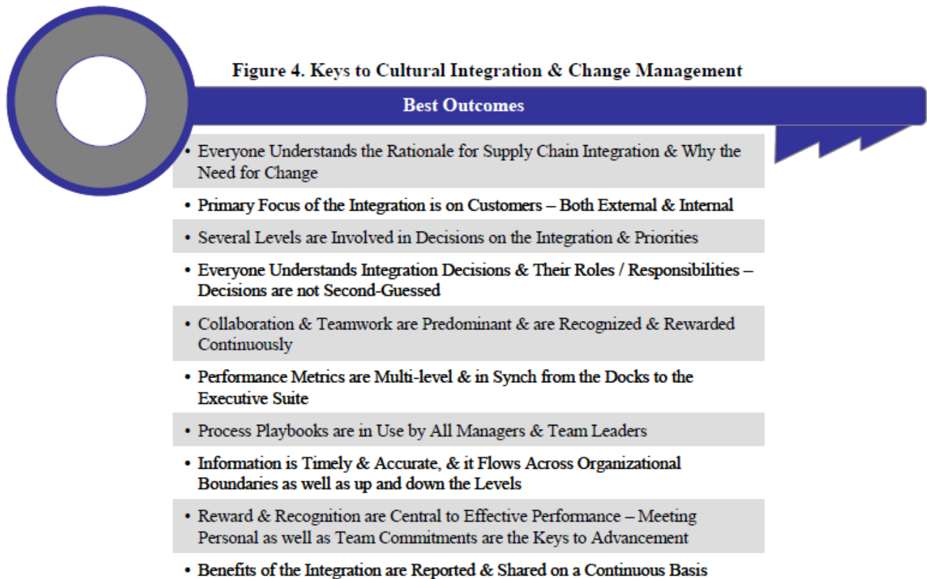
Figure 4. Keys to Cultural Integration & Change Management

what they know, and not what they do not know; and they are functional and task-focused, rather than strategic or process-driven. Yet we know for certain that if change management lacks commitment and sponsorship from executive management, supply chains will not be improved or synergies achieved as expected or planned. Figure 4 below illustrates the best outcomes.