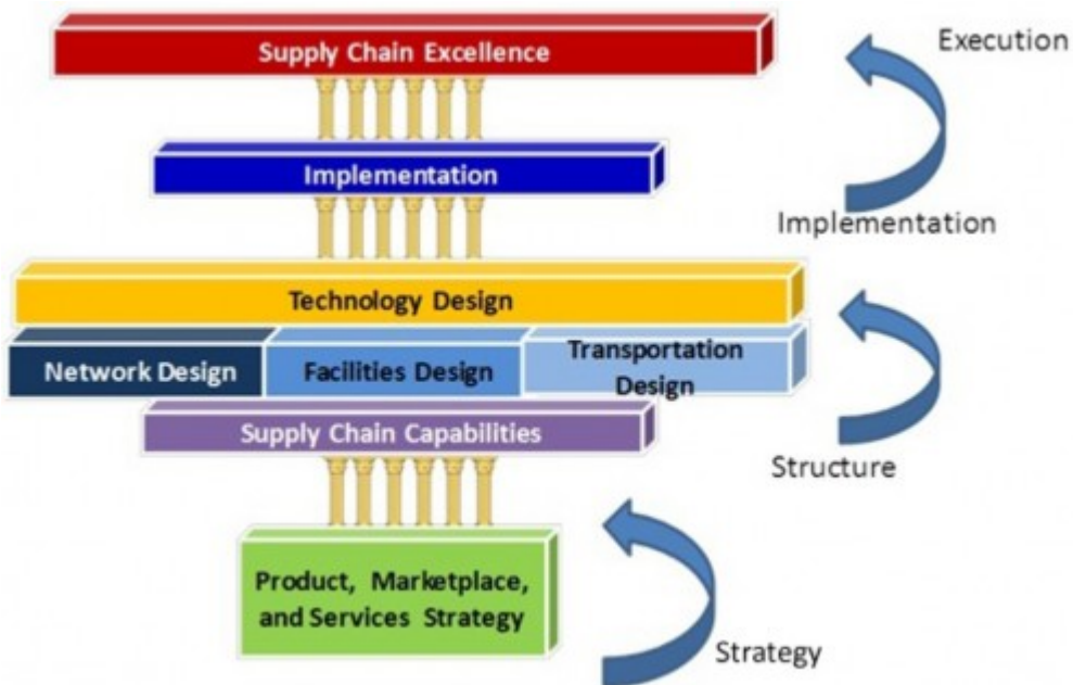
Figure 2. Supply Chain as a Competitive Weapon

Your customer develops product, marketplace, and services strategies. In order to help your customer develop the right logistics capabilities for its supply chain(s), you must understand the go-to-market strategy. Your customer needs to determine what supply chain capabilities are required to meet the marketplace strategy. Often times, 3PLs only receive the information that is shared through a Request for Proposal (RFP) process.